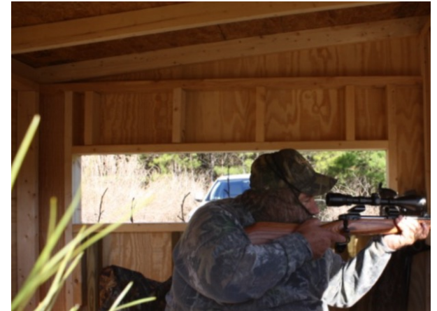
Richard B Russell/Outdoor Dream Foundation Hunting Blinds